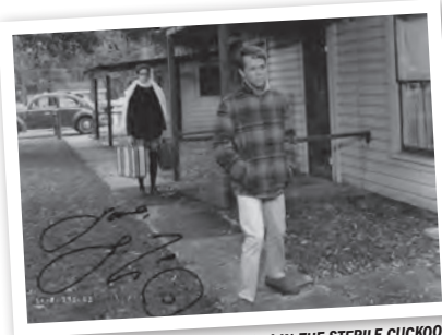
LIZA MINNELLI IN THE STERILE CUCKOO FILMED IN SYLVAN BEACH IN 1969