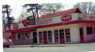
Eddie's in 1964

Our entire menu is available to go. Order on our website or call 315-762-4269.