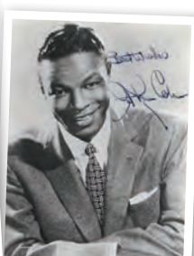
NAT "KING" COLE