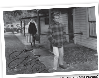
LIZA MINELLI IN THE STERILE CUCKOO FILMED IN SYLVAN BEACH IN 1969