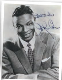
NAT "KING" COLE