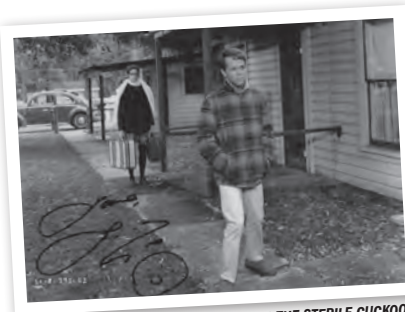
LIZA MINNELLI IN THE STERILE CUCKOO FILMED IN SYLVAN BEACH IN 1969